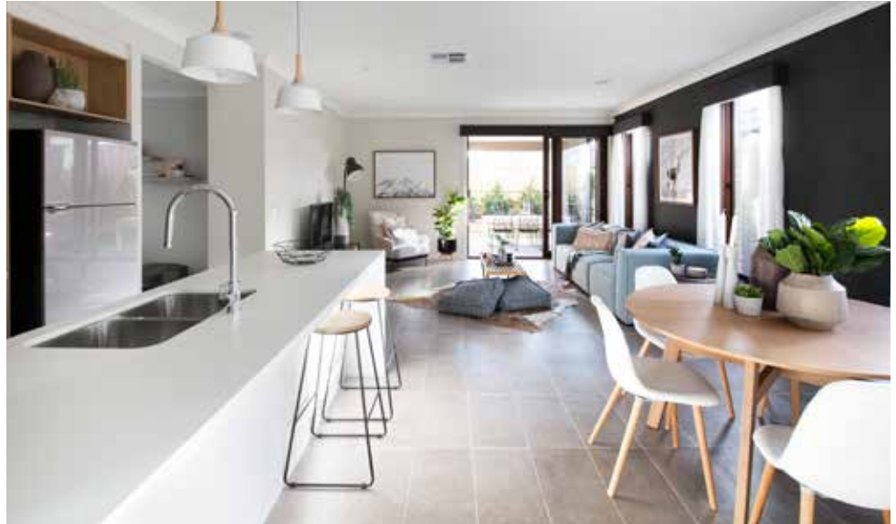
Photo is for illustrative purposes only and does not depict the home for sale. This image contains internal or external luxury upgrade items and furniture not included in the home price.